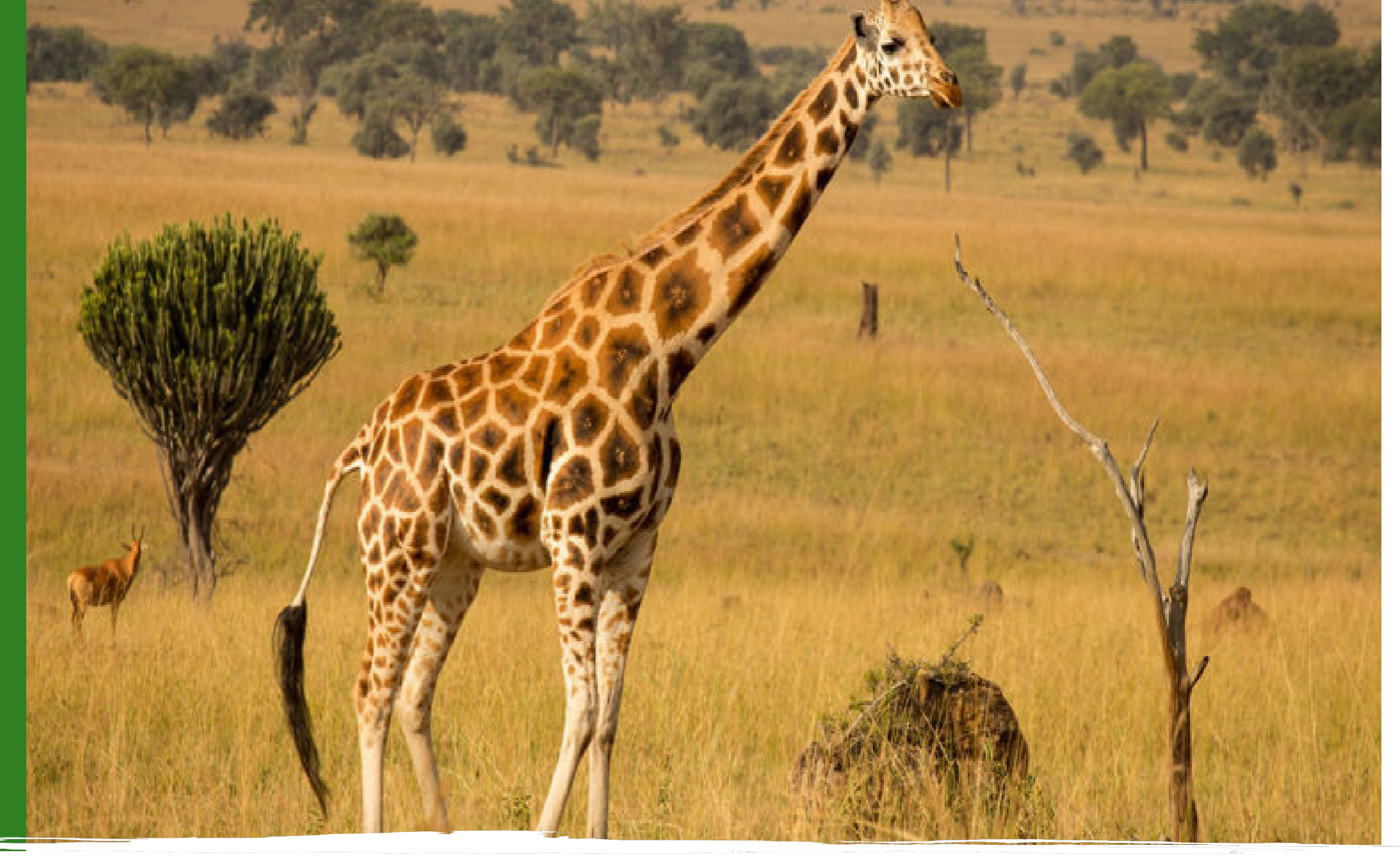
The stunning scenic views of wild animals at Kidepo Valley National Park

Tucked away in the north eastern corner of Uganda is its best kept secret: Kidepo Valley National Park. Kidepo is an unspoiled wilderness of lush green valleys, dramatic mountain ranges, spectacular night skies and amazing sunrises. Uniquely in Uganda, it is home to huge herds of buffalo and mighty prides of lion as well as zebra, eland, cheetah, leopard, ostrich, giraffe, elephant and a variety of endemic bird species. You can easily combine a trip to Kidepo with Aruu Falls.